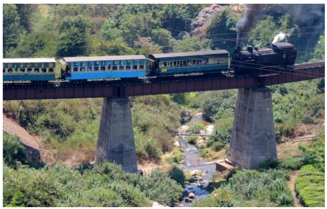
Nilgiris Mountain Railway