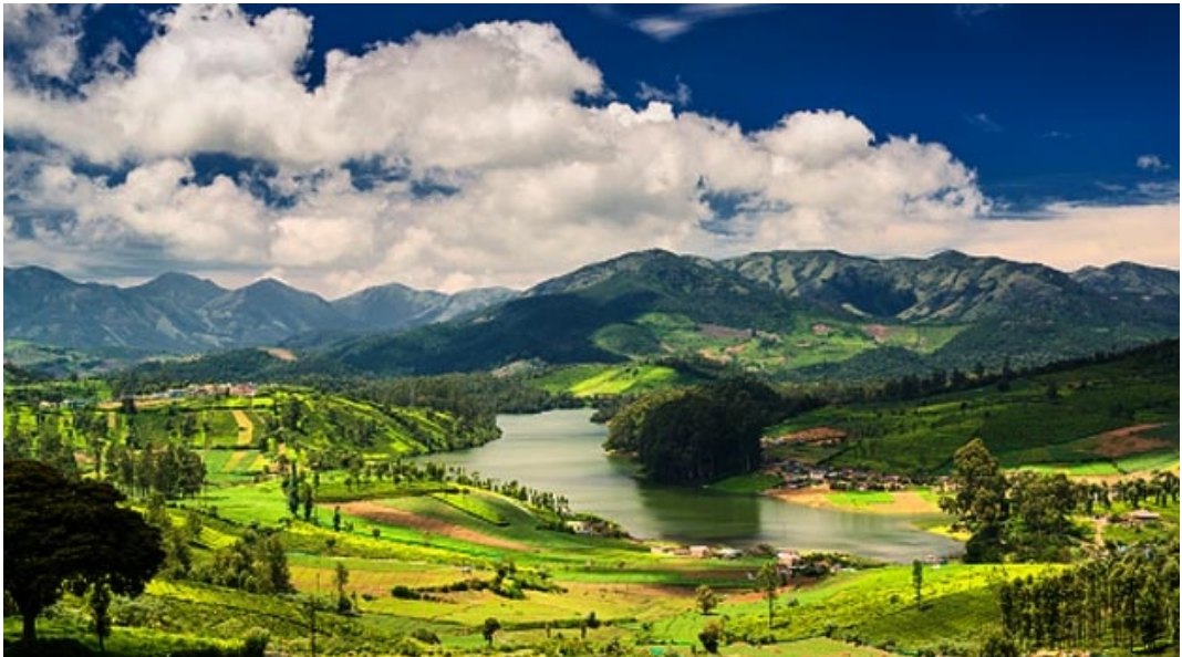
Ooty in typical winter and summer seasons