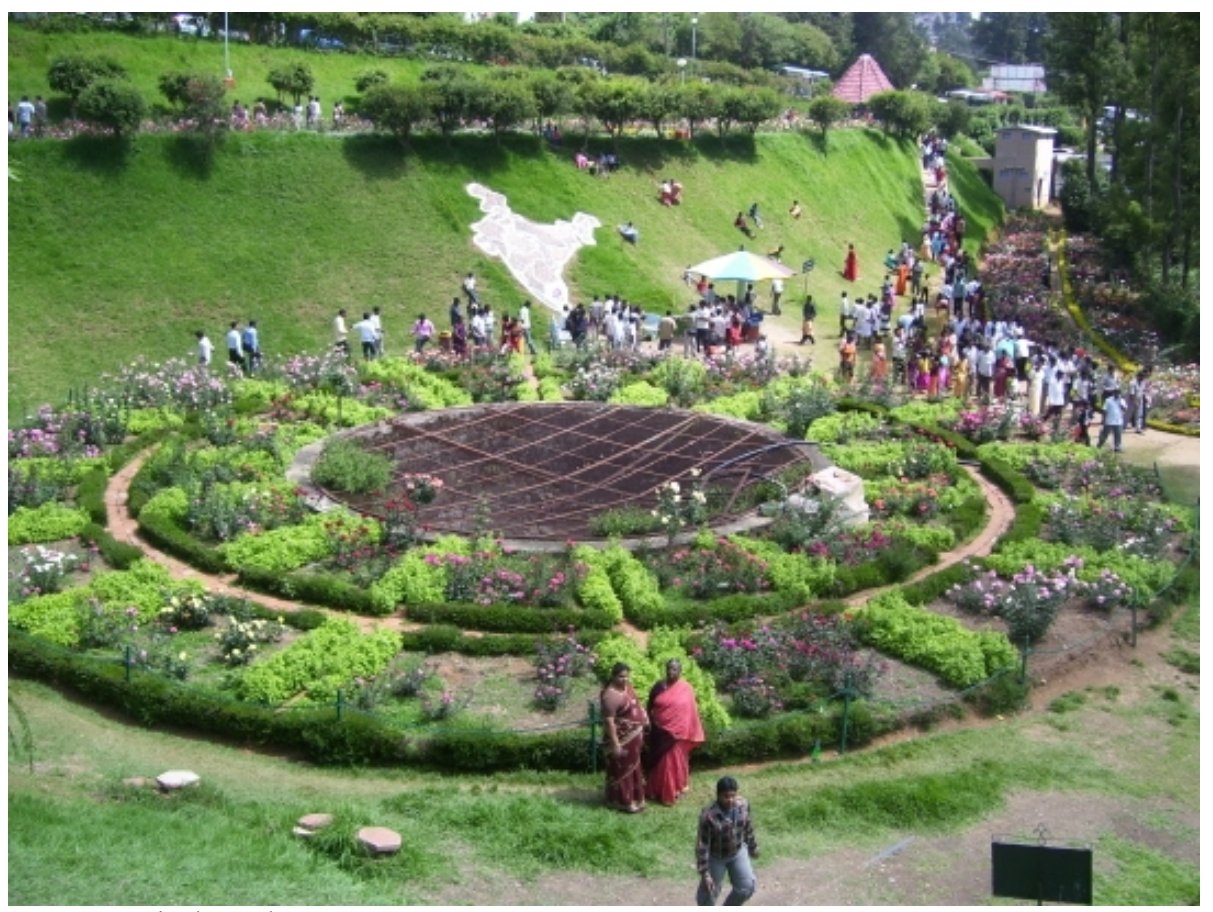
Ooty Botanical Garden