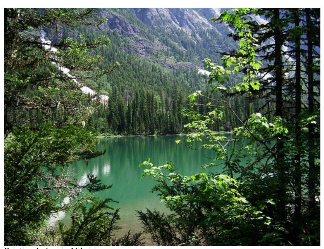
Pristine Lakes in Nilgiris