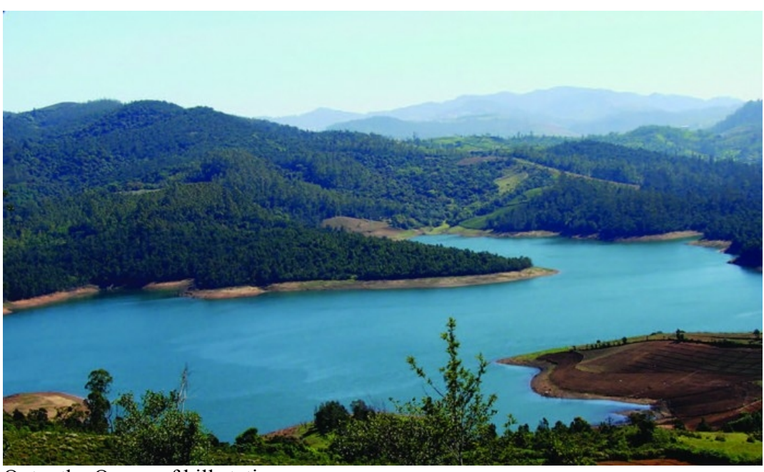
Ooty, the Queen of hill stations