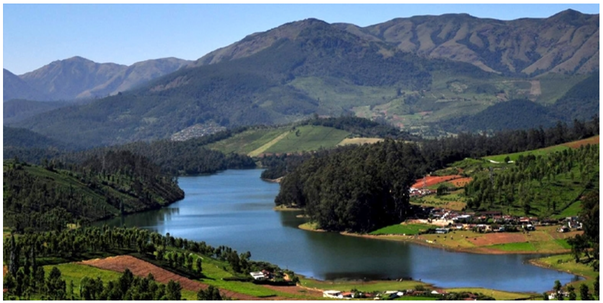
Eye-catchy verdant Nilgiri hills